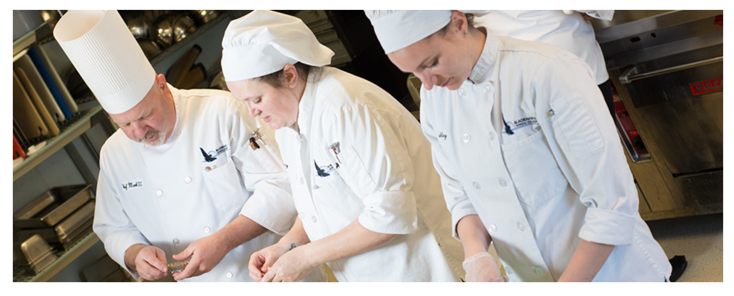
Associate of Applied Science Degree 10-316-1

The Culinary Arts program combines elements of artistry, science and business skills to prepare students for an exciting career in Food Service. Students will study principles of food preparation, quantity production, equipment layout and operation management. Students are involved in preparation and serving experiences in the food service lab and receive additional opportunities in catering, ice sculpting and food presentation. The Culinary Arts program at Blackhawk Technical College has been honored by the Wisconsin Technical College System (WTCS) board with the Exemplary Educational Service Award. The Blackhawk Technical College Culinary Arts Program is accredited by the American Culinary Federation.